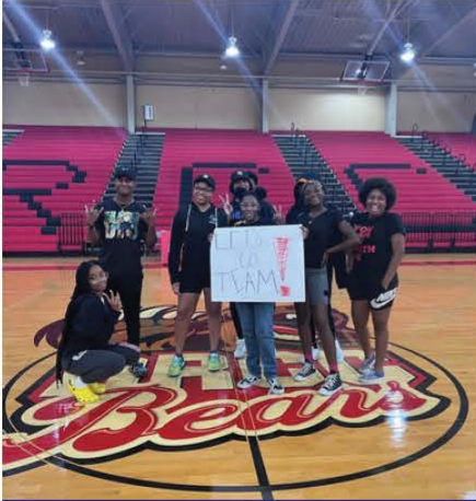
UB seniors. Battle of the Classes winners of 2022!

Although we're all about our academics first, we still like to leave a little room for leisure. Our enrichment trip consisted of going to Universal studios, NASA, Cocoa Beach, Bethune Cookman, and Florida State. While touring the illustrious Bethune Cookman, Dr. Mary Bethune Cookman statue was being unveiled in Washington D.C. replacing a confederate soldier in Lincoln Park.