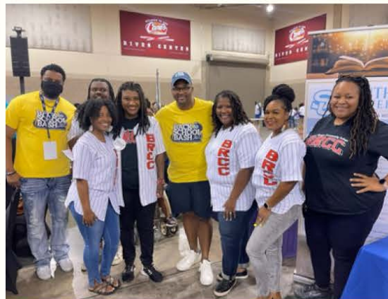
TRIO staff at Back to School Bash at Raising Canes Center