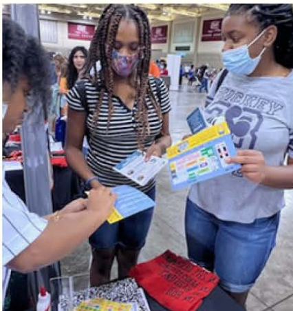
UB outreach specialist assisting UB students at Back to School Bash.

Baton Rouge Community College Receives $3 million in federal grants to continue Upward Bound.