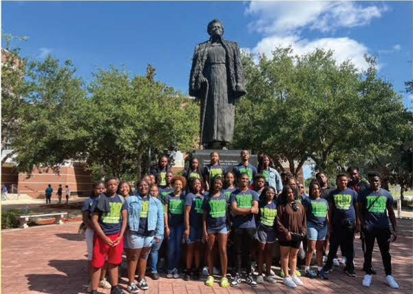
UB students at Bethune Cookman University.

The year is now 2022 and we're just getting out of a global pandemic, and trying to get some normalcy back in our lives. This Summer we were back in person, and coming out the gate stronger than ever. In our 6 week summer program students dissected fetal pigs, learned sign language, and competed in the Bayou soul contest. Here they learned the power of writing out your emotions.