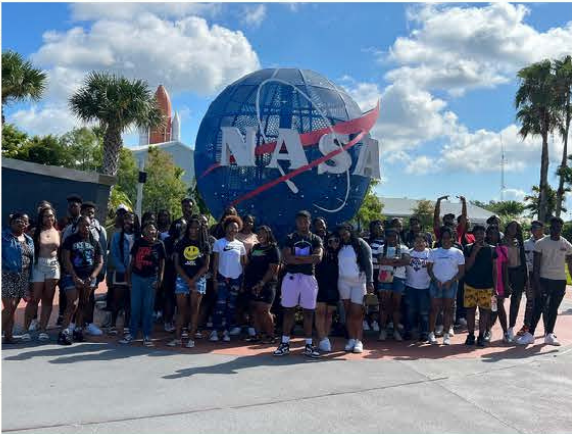
UB students at NASA